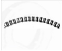
Side Bow Flexible Chain