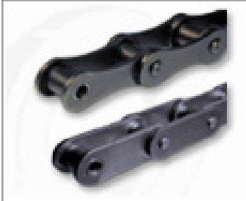
Double Pitch Conveyor Chain

Double Pitch : A2040, A2050, A2060, A2080, A2120