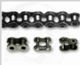
Hollow Pin Chain